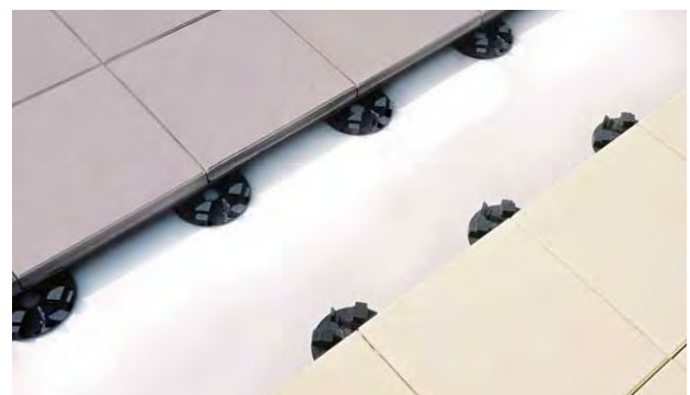
VersiPave® GP supporting pavers