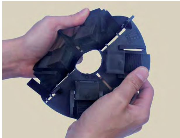
VersiPave® GP and VersiPave® Extenders can be sectioned for use along edges and corners